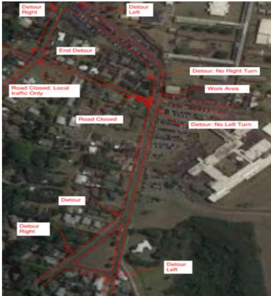
Figure 1: Traffic Control for March 30 to April 3.