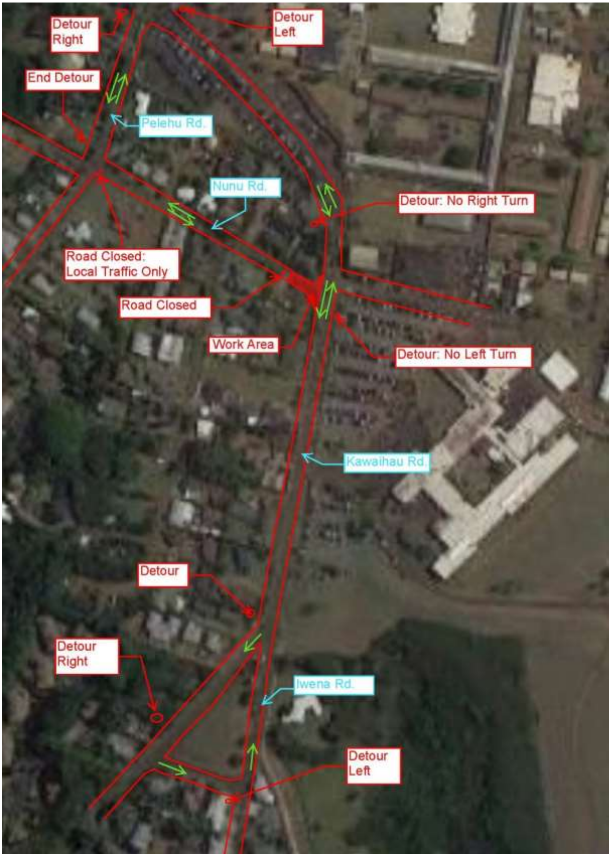
Figure 1: Traffic Control for April 6.