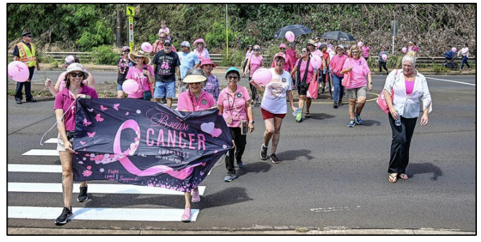
Kaua'i Committee on the Status of Women (KCSW) and supporters of Breast Cancer Awareness return safely during the KCSW walk launching October as Breast Cancer Awareness Month on Monday, Oct. 2, 2023.